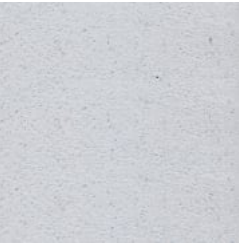
Precast Concrete White Marble Sandblasted