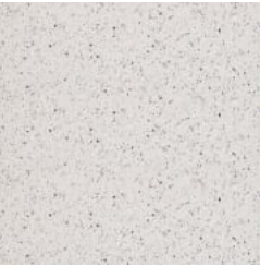
Precast Concrete White Granite Brushed