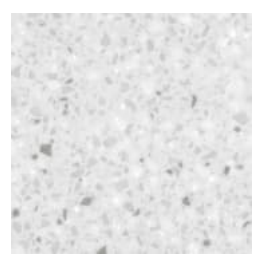
Corian® Solid Surface Silver Birch