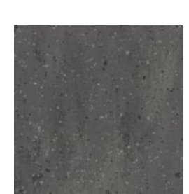
Corian® Solid Surface Carbon Aggregate