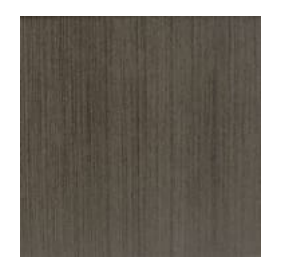
Laminex® Multipurpose Compact Laminate Licorice Linea