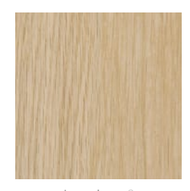
Laminex® Multipurpose Compact Laminate Calm Oak