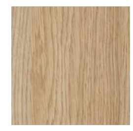
Laminex® Multipurpose Compact Laminate Classic Oak