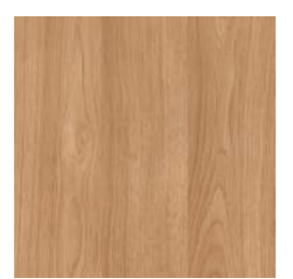
Laminex® Multipurpose Compact Laminate Elegant Oak