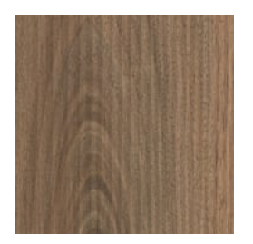
Laminex® Multipurpose Compact Laminate Natural Walnut