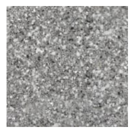
Corian® Solid Surface Platinum