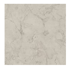
Laminex® Multipurpose Compact Laminate Figured Limestone