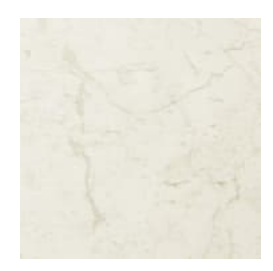
Laminex® Multipurpose Compact Laminate White Valencia