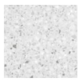
Corian® Solid Surface Silver Birch