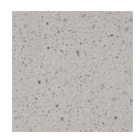
Laminex® Multipurpose Compact Laminate Limed Concrete