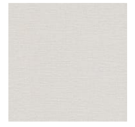
Baresque Meru Upholstery Fabric Chablis