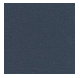
Baresque Meru Upholstery Fabric Lake