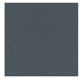
Baresque Meru Upholstery Fabric Abyss