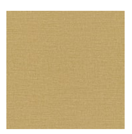
Baresque Meru Upholstery Fabric Nectar