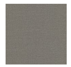
Baresque Meru Upholstery Fabric Root