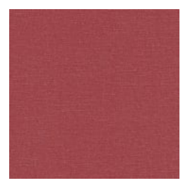
Baresque Meru Upholstery Fabric Fiesta