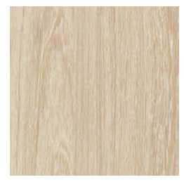
Laminex® Multipurpose Compact Laminate Seasoned Oak