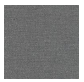
Baresque Meru Upholstery Fabric Charcoal