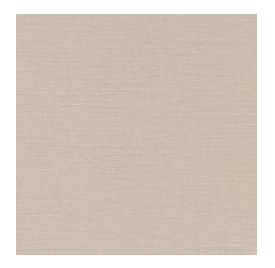
Baresque Meru Upholstery Fabric Nickel