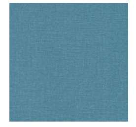
Baresque Meru Upholstery Fabric Caribbean