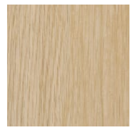
Laminex® Multipurpose Compact Laminate Calm Oak